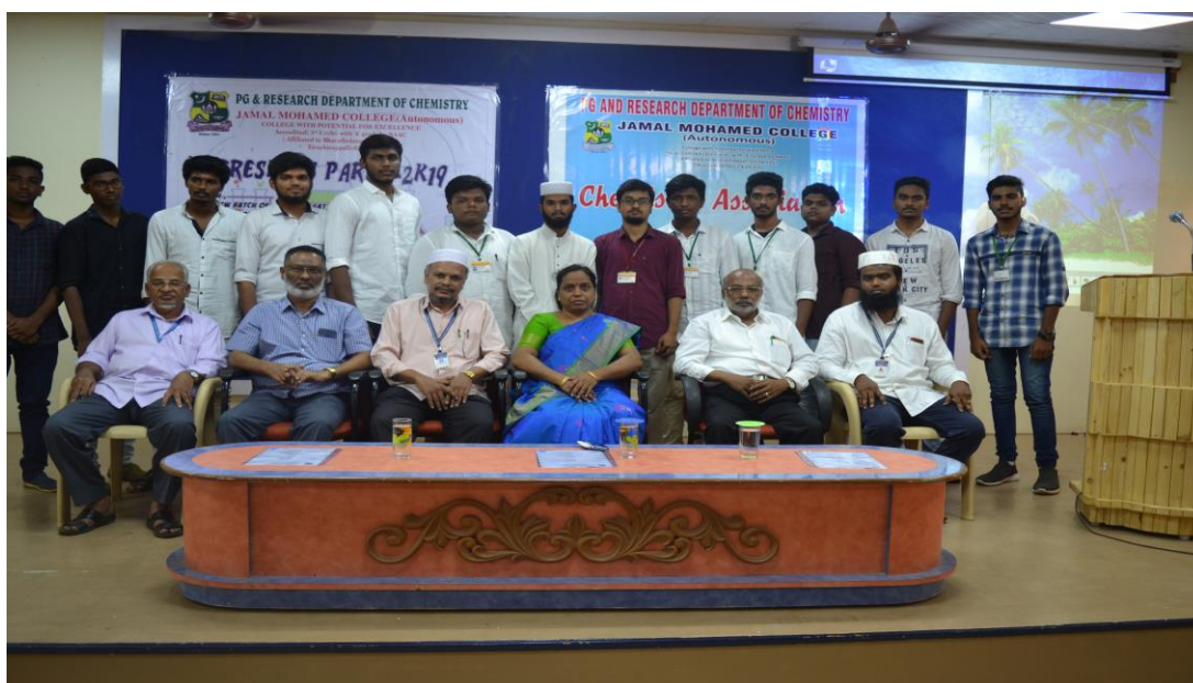
Introduction the scenario of office bearers