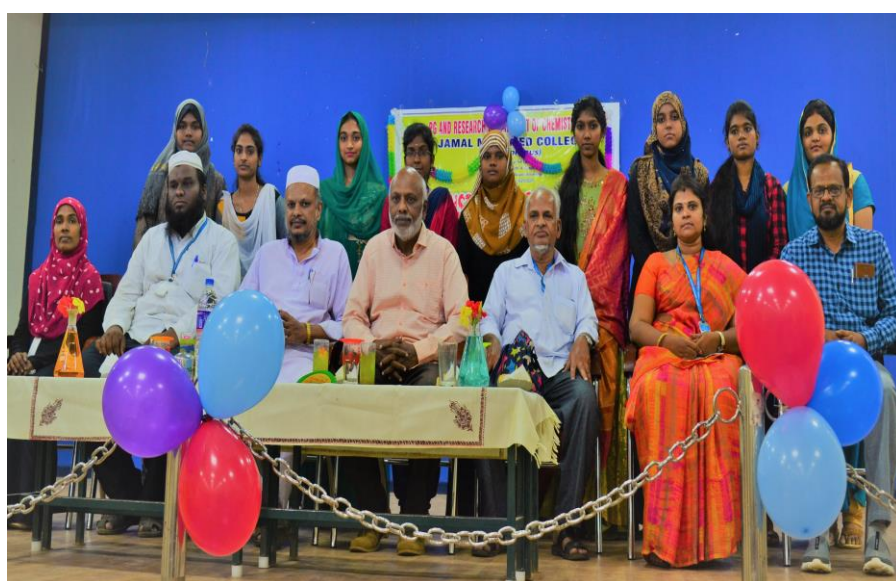
Introduction scenario of office bearers